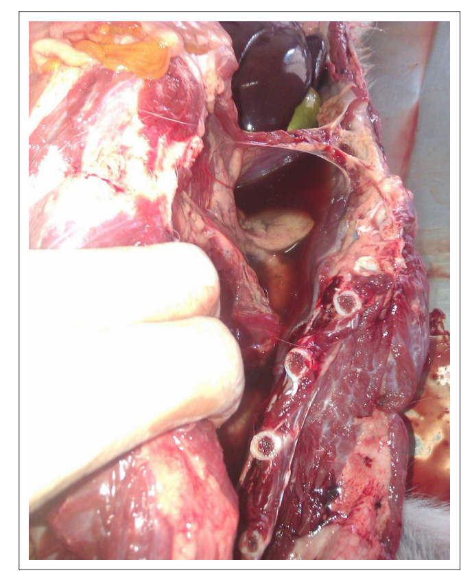
Note: In addition to the hydrothorax there was severe oedema of the mediastinum and moderate hydropericardium.

On 20 April 2012 whole blood and serum samples were collected from the resident dogs using Ethylenediaminetetraacetic acid and clot-activating tubes respectively. Whole blood